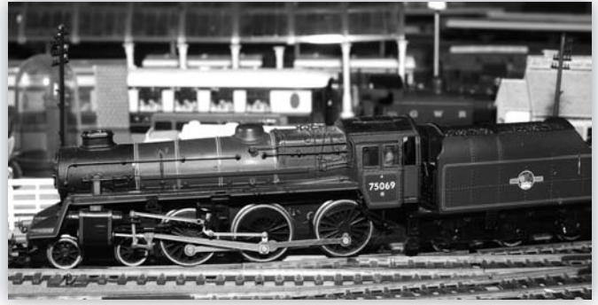
Pecorama model railway display