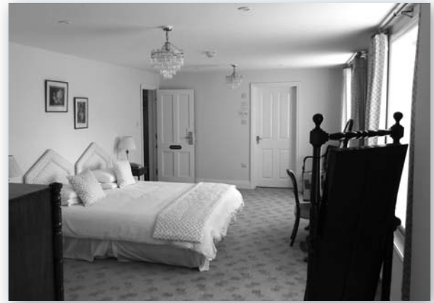
Left and above: The spacious new Henry Suite with walk in shower and roll top bath