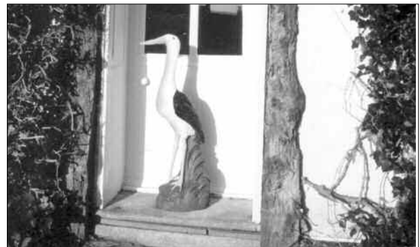
The 'Crane' mascot