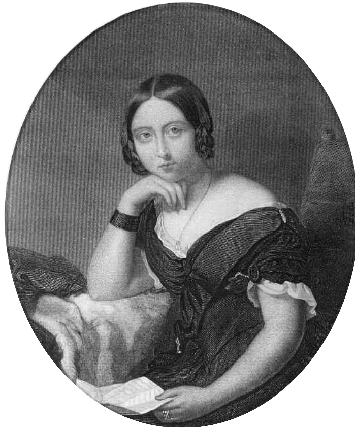
A rare print depicting a young Victoria (see story below)

NEWSLETTER OF THE ROYAL GLEN HOTEL • SIDMOUTH