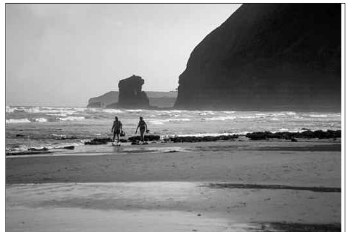
Walkers near Ladrham Bay

When you walk along the South West Coastal Path (celebrating its 25-year anniversary) every step you take is a step through time. 185 million years in a 155 kilometre stretch. Between Exmouth and Portland, you discover geology spanning three periods of Earth's history. Our most local highlight is of course the red sandstone rocks at Ladrham Bay and Sidmouth, a reminder that 250 million years ago during the Triassic period, the area was desert & joined to Kansas. In the Lyme Regis Philpot Museum fossil displays can be found or you can collect your own form the beach especially in Winter when the weather exposes new stone. For those wanting to find out more you can obtain the Official Guide with a foreward by H.R.H The Prince of Wales from the T.I.C or visit: www.jurassiccoast.com