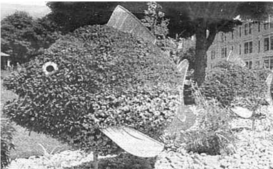
'Floral fish' at the Three Cornered Plot as featured on the BBC

The Committee this year produced Sidmouth's Floral Trail , a leaflet welcoming residents and visitors to East Devon's town of flowers. It maps out a walk from Royal York to Mill Ford & Old Toll House, to Blackmore Gardens, Old Fore Street, Church Street and to the Three Cornered Plot. Did you see the Trio of Fish swimming there? They appeared on a special BBC Gardeners World 'Britain in Bloom' edition screened on BBC1 in October in which Sidmouth began and ended the hour long programme.