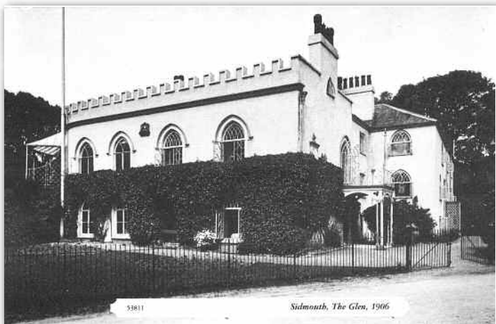
Postcard featuring The Royal Glen circa 1906