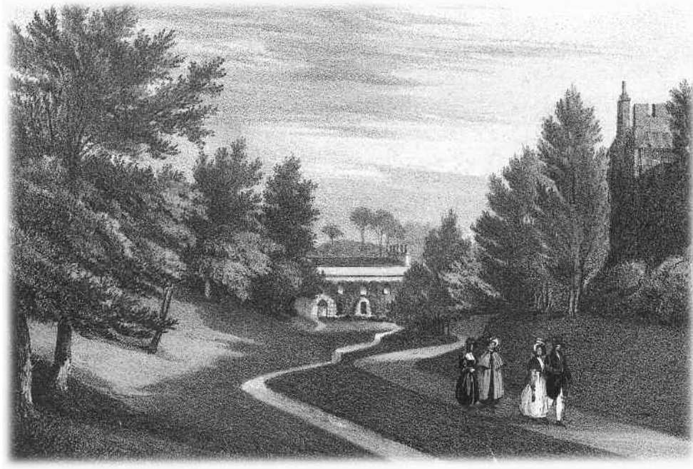
The Royal Glen circa 1832

NEWSLETTER OF THE ROYAL GLEN HOTEL • SIDMOUTH